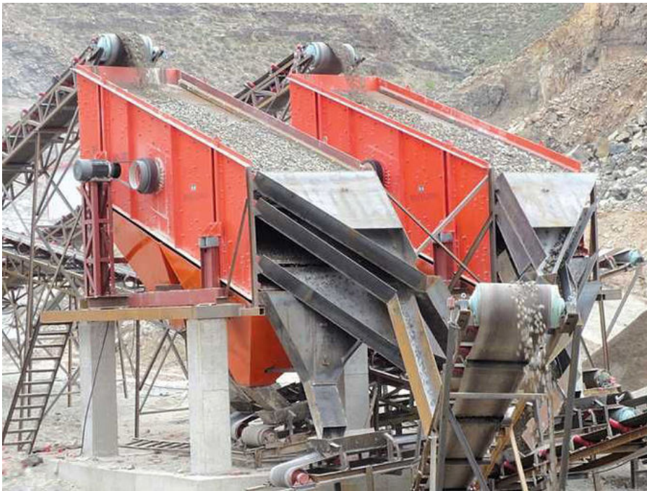
Vibrating screen package and delivery