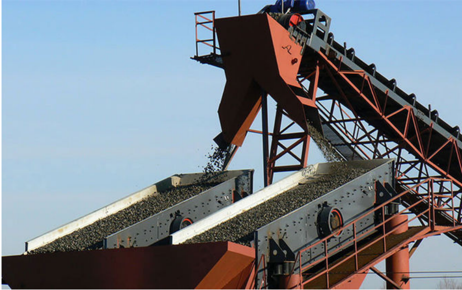
Customer working site