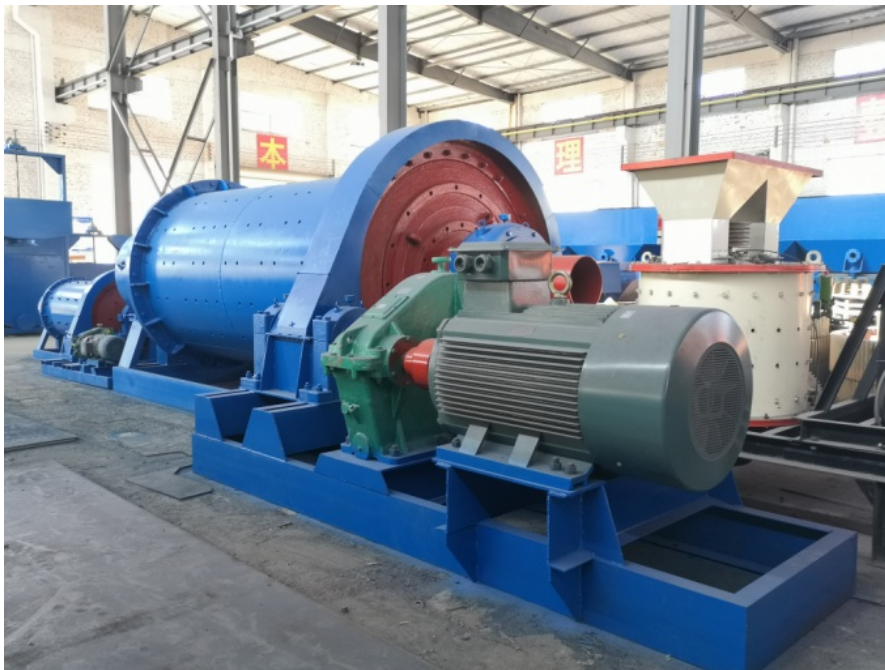
Ball mill liners and steel balls