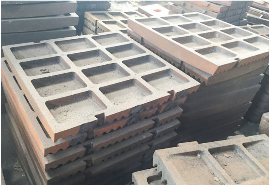
Jaw crusher plate product pictures

We can supply or OEM according to your crusher parts drawing of these famous brand, , sandvik, Hazma, erex, McClosky, SBM, Zenith, Liming, etc.