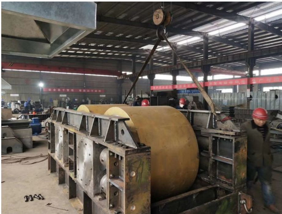
Product spare parts