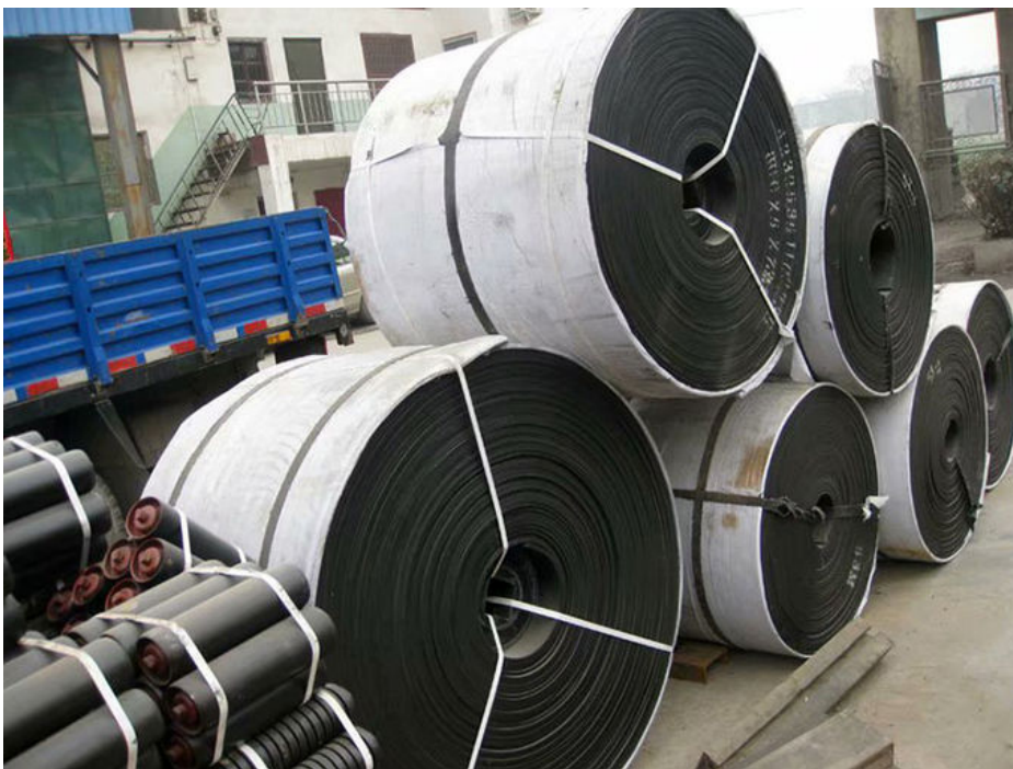
Belt conveyor working site