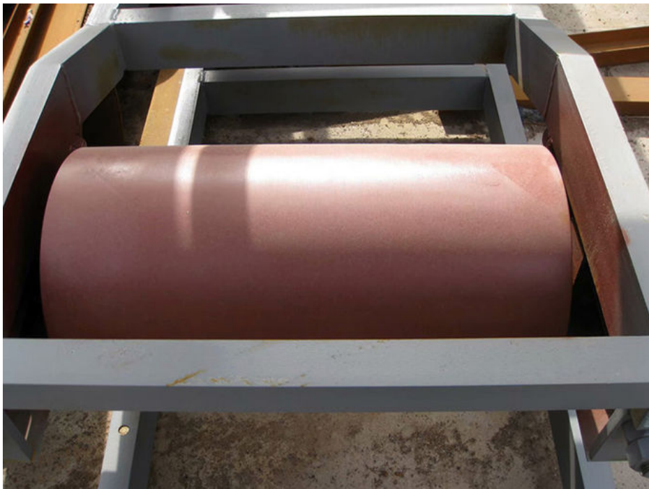
Belt conveyor working site