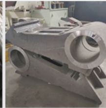
Jaw plate assembly