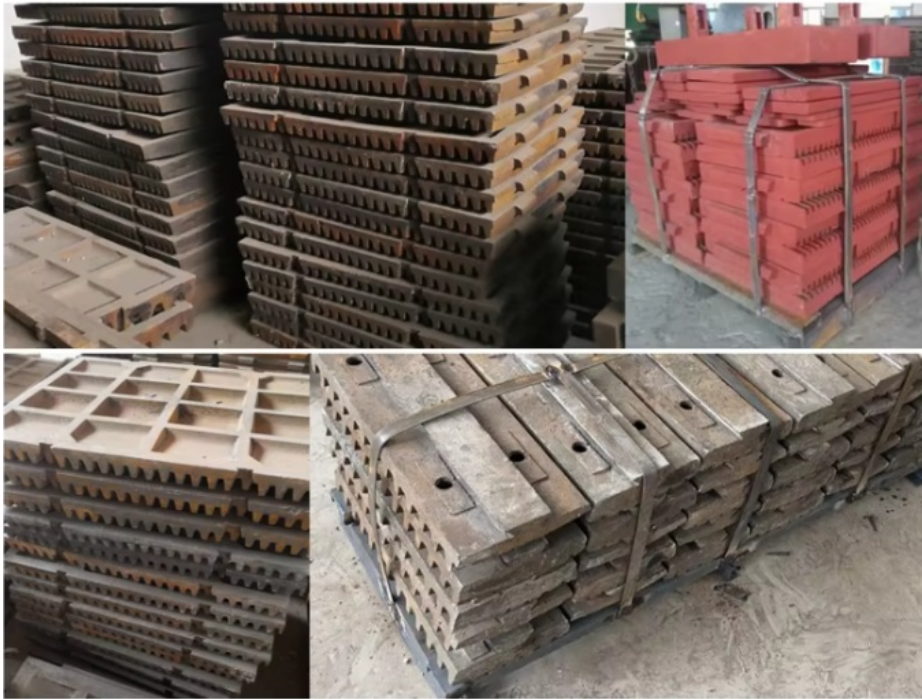
Paching & Delivery