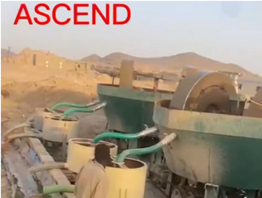
ASCEND engineer assist installation in Sudan