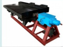
6-S Shaking Table