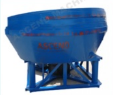
Wet Pan Mill