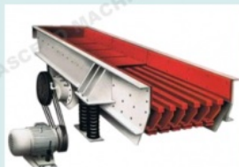
GZD Vibrating Feeder